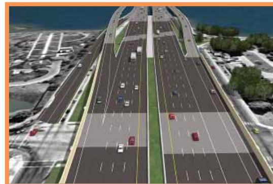
SR 408 west of Lake Underhill - Proposed View

AESTHETIC TREATMENTS: The project includes installing eight-foot tall, stepped sound barrier walls with decorative panels and post caps. As planned, the sound walls will stretch along the eastbound and westbound sides at roadway level for the length of this project. Each bridge will also feature decorative architectural pylons, columns, panels, planter walls and sound walls.