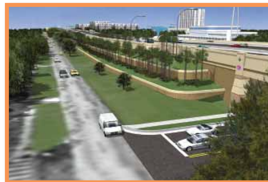
Summerlin Avenue and Anderson Street - Proposed View